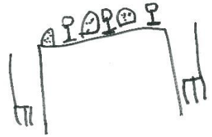
Drawing by Audrey Schroeder

without blemish, a year-old male; you may take it from the sheep or from the goats. You shall keep it until the fourteenth day of this month; then the whole assembled congregation of Israel shall slaughter it at twilight. They shall take some of the blood and put it on the two doorposts and the lintel of the houses in which they eat it. They shall eat the lamb that same night; they shall eat it roasted over the fire with unleavened bread and bitter herbs. Do not eat any of it raw or boiled in water, but roasted over the fire, with its head, legs, and inner organs. You shall let none of it remain until the morning; anything that remains until the morning you shall burn. This is how you shall eat it: your loins girded, your sandals on your feet, and your staff in your hand; and you shall eat it hurriedly. It is the passover of the LORD. For I will pass through the land of Egypt that night, and I will strike down every firstborn in the land of Egypt, both human beings and animals; on all the gods of Egypt I will execute judgments: I am the LORD. The blood shall be a sign for you on the houses