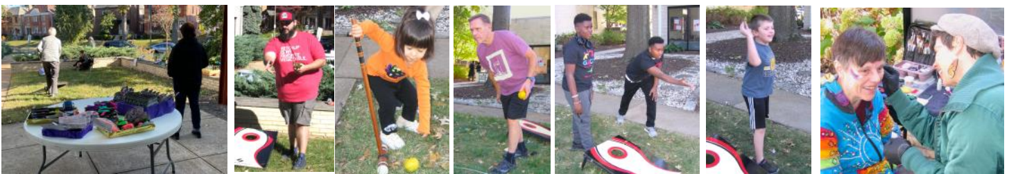
Outside there were plenty of games to play as well as a Face Painter in the morning.